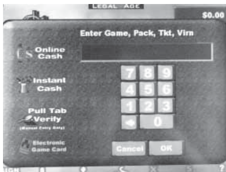
The screen shown above is used in validation of the game card.

Keep all validated cards to be picked up by your DSR.