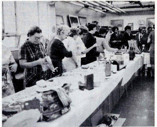
Shown are some of the items sold and the crowd at the Christmas Arts and Crafts Bazaar.

ALL VETERANS' COMMITTEE IOWA SOLDIERS' HOME MARSHALLTOWN, IOWA 50158