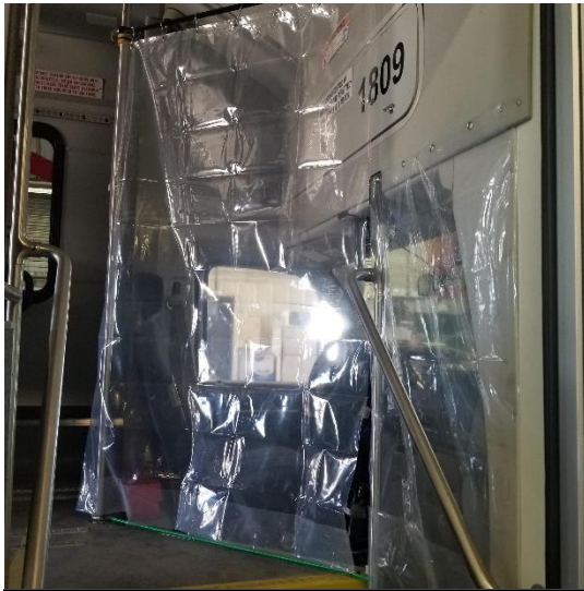
Clear shower curtains hung to protect transit drivers from virus particulates.

Iowa's transit agencies were the recipients of federal CARES Act, CRRSAA, and ARPA funding, paying for up to 100% of the operating deficit for services after January 20, 2020. Iowa DOT's public transit team administers the distribution of those funds to the small urban and regional systems while large urban systems receive their COVID-relief dollars directly from the FTA.