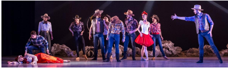
Ballet Quad Cities