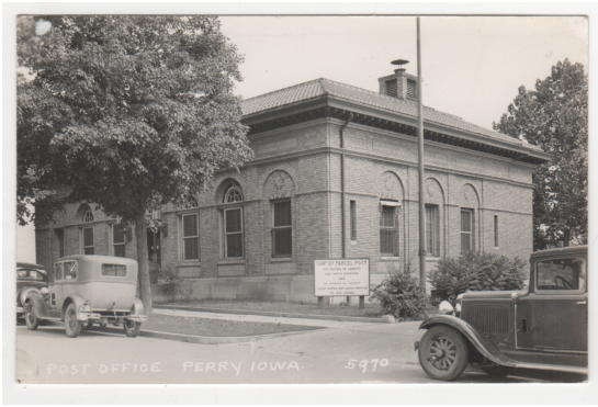
Perry Post Office, ca. 1915.