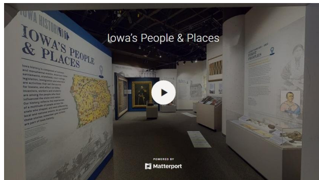
Image: Take a virtual tour of the museum's "Iowa People & Places" exhibition.

"Hands on History" and "Goldie's Creative Corner" invite children ages 10 and younger to learn from Goldie's Kids Club activities and play with Duplo blocks, crayons and more. They can examine a Lego model of Iowa's tallest skyscraper; an Erector Set Ferris wheel; Iowa's state rock, a geode; Gregory Lion, a puppet from WOI-TV's "The Magic Window;" an Oliver Super 77 tractor and more.