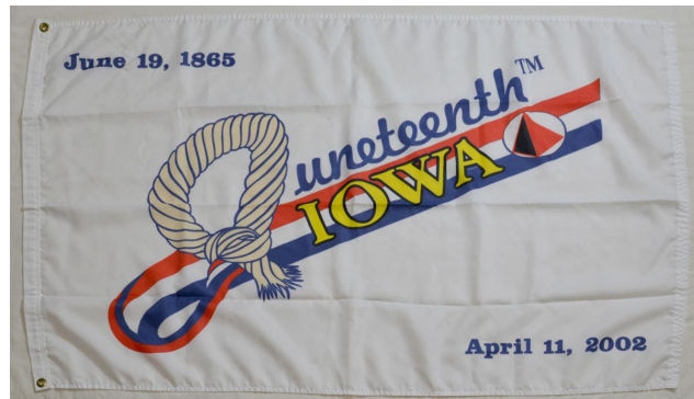
A banner marking the date when Juneteenth became a state holiday in Iowa.

Emancipation events in Iowa took place prior to the Civil War in Muscatine, and communities of various sizes including Clarinda, Corning, and Sioux City have hosted events. The gatherings show that Iowans of many backgrounds have come together to celebrate freedom and equality.