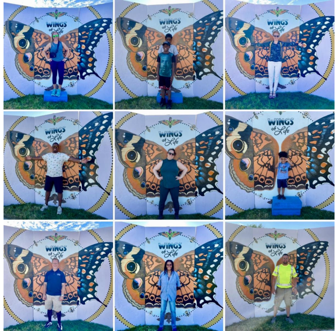
"Wings of Life," a mural in Dubuque.

Learn what community leaders have to say about artist-based community development projects in this fresh, new blog from the Iowa Arts Council. Then register for the 2022 Iowa Arts Summit to hear directly from Springboard for the Arts.