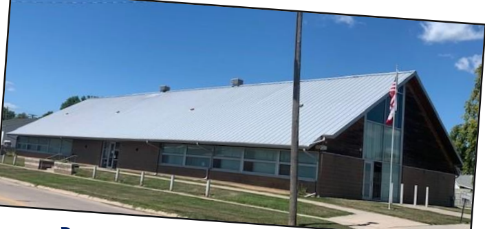
Residential Treatment Center (RTC)

The average stay is between three (3) and six (6) months.