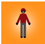
WEAR LONG SLEEVED SHIRTS, TROUSERS, HATS