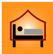
USE MOSQUITO NETS IF MOSQUITOES ARE IN SLEEPING AREA