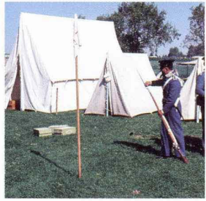
SHSI, Chuck Greiner

When constructed in 1842, Fort Atkinson had 28 buildings and a stockade wall. The War Department abandoned the fort in 1849, selling the land and buildings in 1855 to local settlers. Most of the buildings were then altered or destroyed. Through research and archaeological surveys, portions of the fort were reconstructed and a museum was placed in one of the barracks. A Rendezvous is held the last full weekend in September each year when artisans, musicians and costumed army troops recreate an early era in Iowa history.