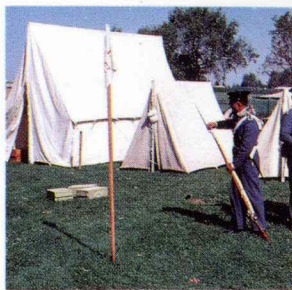
SHSI, Chuck Greiner

Other natural and cultural points of interest in the area include Backbone State Park, Pike's Peak State Park, Volga River Recreation Area, Yellow River State Forest, Montauk Historic Governor's Home, Bily Clock Museum, and the Vesterheim Norwegian-American Museum.