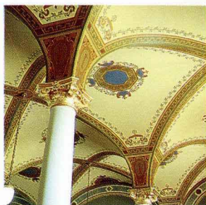
SHSI, Chuck Greiner

Every aspect of the Capitol's architecture is breathtaking for visitors, from mosaic artwork and detailed stenciling, to the marble Grand Stairway, three-story open rotunda and the statues and monuments surrounding the building.