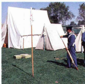
SHSI, Chuck Greiner

Other natural and cultural points of interest in the area include Backbone State Park, Pike's Peak State Park, Volga River Recreation Area, Yellow River State Forest, Montauk Historic Governor's Home, Bily Clock Museum, and the Vesterheim Norwegian-American Museum.