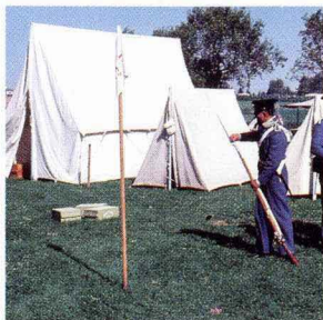
SHSI, Chuck Greiner

Other natural and cultural points of interest in the area include Backbone State Park, Pike's Peak State Park, Volga River Recreation Area, Yellow River State Forest, Montauk Historic Governor's Home, Bily Clock Museum, and the Vesterheim Norwegian-American Museum.