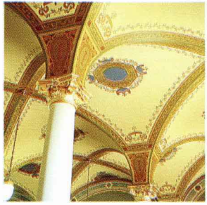
SHSI, Chuck Greiner

Every aspect of the Capitol's architecture is breathtaking for visitors, from mosaic artwork and detailed stenciling, to the marble Grand Stairway, three-story open rotunda and the statues and monuments surrounding the building.