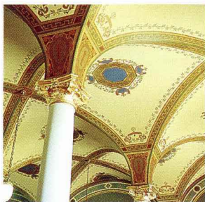
SHSI, Chuck Greiner

Every aspect of the Capitol's architecture is breathtaking for visitors, from mosaic artwork and detailed stenciling, to the marble Grand Stairway, three-story open rotunda and the statues and monuments surrounding the building.