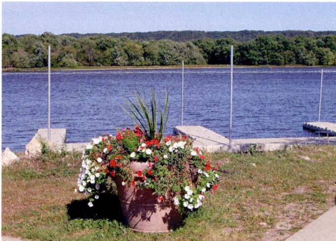
Keep Iowa Beautiful funded blooming plants along the Great River Road at the Iowa Department of Natural Resources Boat Ramp in Guttenberg.