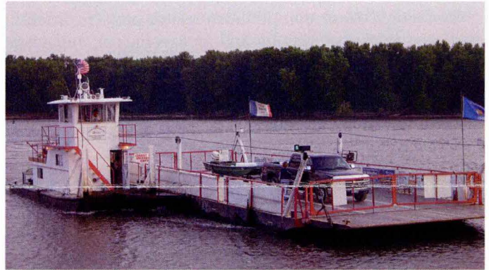
The Cassville Ferry