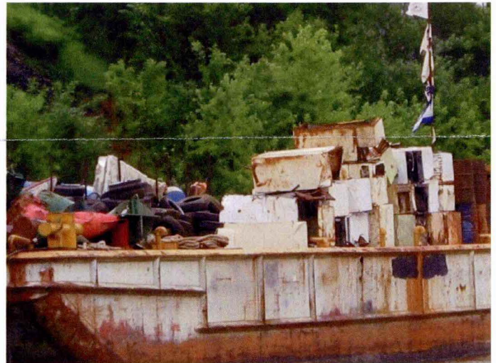
The LLW barge displays the catch of the day.