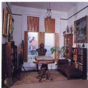
SHSI, Joan Liffing-Zug

Outdoor enthusiasts will enjoy canoeing, tubing, hiking, biking, skiing, fishing and golfing. Stay overnight at a restored hotel, at one of several bed and breakfast inns or at a campground located on the Turkey River. Plan now to attend special events including Threshing Days, Fall Foliage Festival, organ recitals and Christmas Open House and Teas.