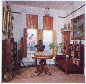
SHSI, Joan Liffing-Zug

Outdoor enthusiasts will enjoy canoeing, tubing, hiking, biking, skiing, fishing and golfing. Stay overnight at a restored hotel, at one of several bed and breakfast inns or at a campground located on the Turkey River. Plan now to attend special events including Threshing Days, Fall Foliage Festival, organ recitals and Christmas Open House and Teas.