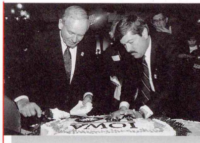
Governor Terry E. Branstad and former Governor Robert D. Ray cut the Iowa birthday cake.