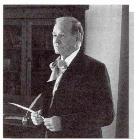
Governor Terry E. Branstad and former Governor Robert D. Ray portray the role of the first governor of Iowa, Ansel Briggs, at the Old Capitol, Iowa City.