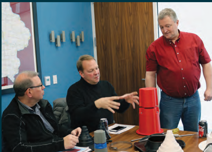
WindSmart leaders meet with CIRAS to discuss the latest iteration of the new vents (in red).

For more information, contact Jodi Essex at jodir@iastate.edu or 515-509-0769.