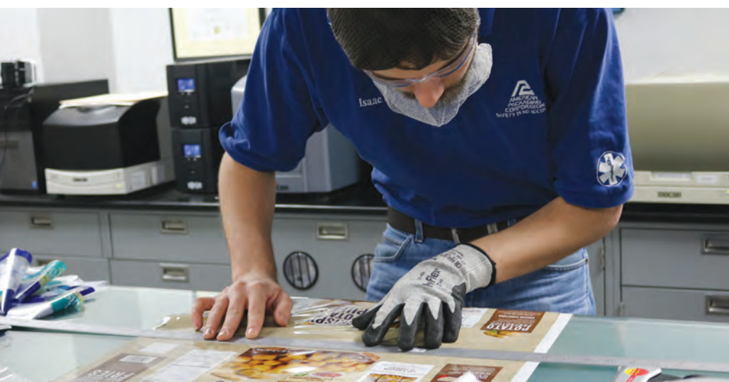
Top: Workers move spindles of completed packaging. Bottom: An American Packaging employee checks quality on a bag for frozen potatoes.