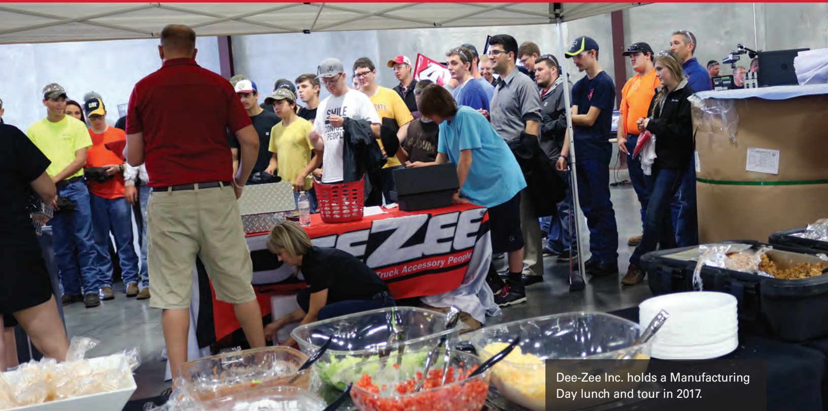
Dee-Zee Inc. holds a Manufacturing Day lunch and tour in 2017.