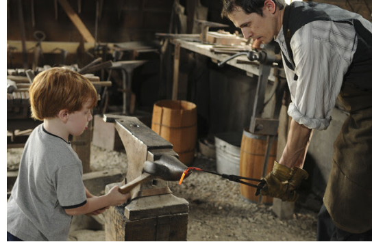
Photo: Living History Farms blacksmith shop

The program aims to help sustain artistic traditions and cultural heritage in Iowa by encouraging master artists and culture bearers to pass along their knowledge and skills to emerging and apprentice artists.