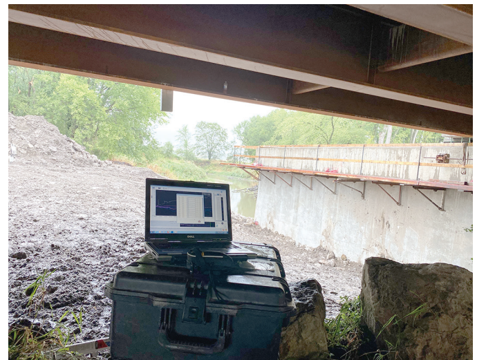
Data collection station used for multi-span bridge slide-in field monitoring