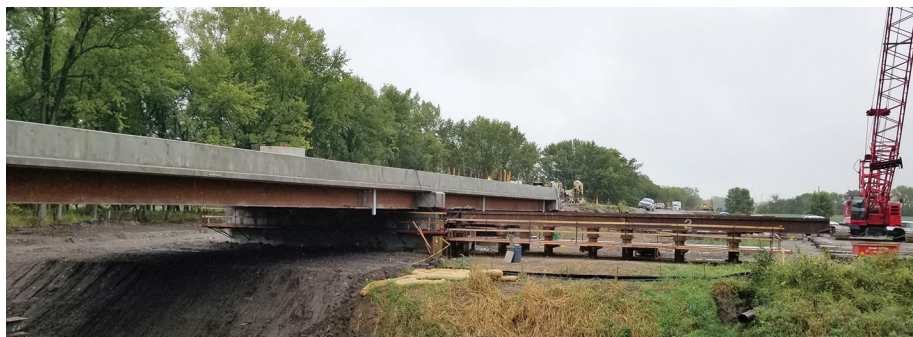
Construction of IA 1 Bridge over Old Man's Creek southwest of Iowa City

In some states, such as Iowa, the use of ABC has been strategically deployed at locations where traffic volume, access, and other factors drive the need for a very short disruption to the traveling public.