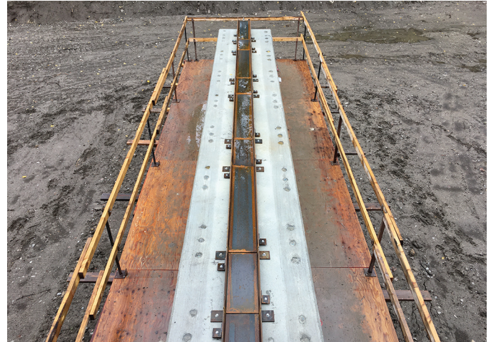
Sliding track on the permanent pier for the IA 1 Bridge over Old Man's Creek

In Task 4, the researchers monitored a three-span, 300-ft-long, steel girder bridge over Old Man's Creek on IA 1 southwest of Iowa City that was constructed utilizing the SIBC method using gauges during the slide-in. The goal of this task was to monitor the lateral slide effects on the bridge and its associated structural elements to gain useful insights.