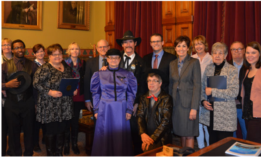
Gov. Kim Reynolds and Lt. Gov. Adam Gregg with members of the Pella Historical Society and the Wallace Winkie Foundation during the Excellence in Iowa History Award ceremony in 2018.

its Excellence in Iowa History Awards , which honor individuals, organizations and communities that made outstanding contributions to Iowa history in 2021. The awards recognize publications, local history initiatives and major achievements in Iowa history.