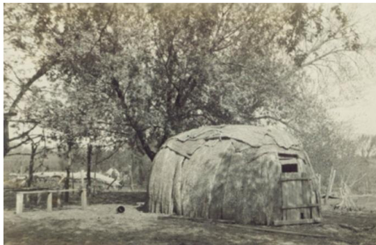
A traditional Meskwaki home.