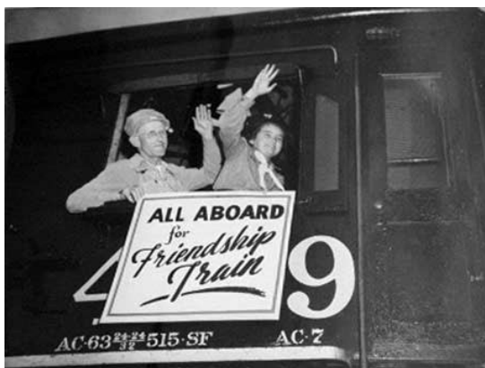
The Friendship Train.