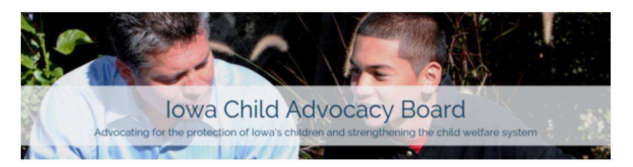
CAB Connection - October 2020