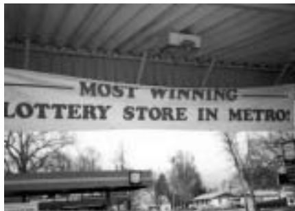
This sign in front of Darrah's Total explains why they get lots of lottery business.