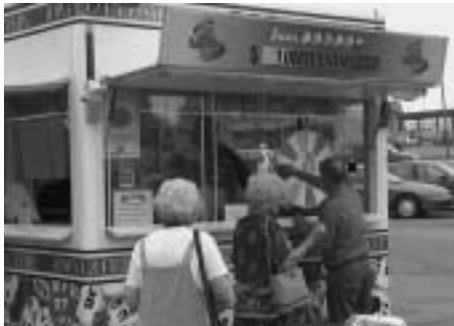
The "Lottery on Wheels" visits events and retailers all across Iowa from June through October.

The "Lottery on Wheels" is a traveling fun center— lottery employees come to your location and sell tickets (for which you get the commission!) and give away lottery merchandise prizes to players. Many retailers use the trailer in coordination with special events for their business, like a grand opening, anniversary or customer appreciation day.