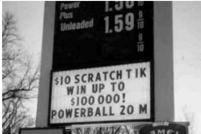
Todd's uses outdoor signage to advertise lottery.

Todd's displays winners' names of $100 or