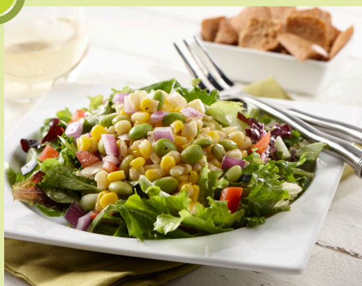
Edamame and Corn Salad

Recipe and photo courtesy of The Soyfoods Council