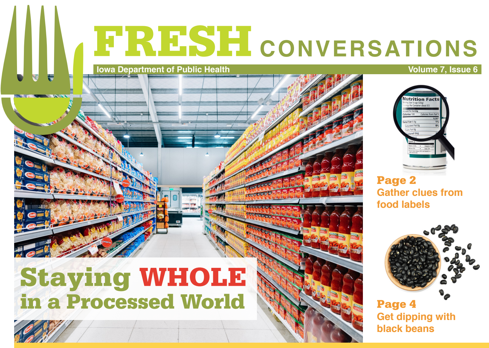
DID YOU KNOW? Supermarkets now have 4x the number of items than they did in the 1960s.

Think back to what your local grocery store looked like 40 years ago, 20 years ago or even 10 years ago. The grocery shopping experience continues to evolve. Marketing techniques have changed. Packaging looks different. Your choices as a consumer are endless. Think about the main influences that drive your decision while shopping.