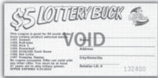
This Lottery Buck and several others will expire June 30.

To get immediate credit for a coupon, you must enter the coupon number into the terminal after you make the play the customer requests. A box or space will appear where you must enter the coupon number. When you do this correctly, the terminal will give you credit for that coupon. 🎰