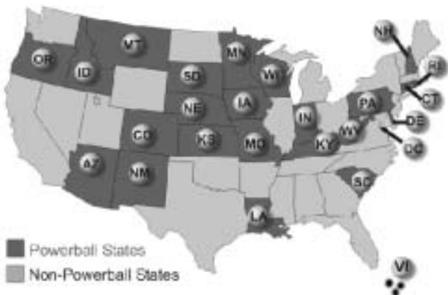
This map shows the lotteries that participate in Powerball.

Powerball has helped the Iowa Lottery raise valuable funding for state programs and provided millions of dollars in prizes to Iowa players.