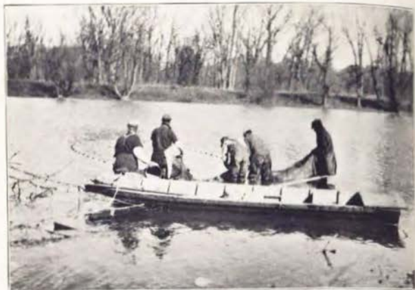
Sorting the Fish. Note men standing in Bayou showing dept of the water, where fish would perish during winter months.