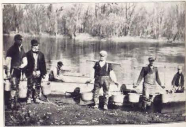
Method of Carrying the Rescued Fish to the Station.