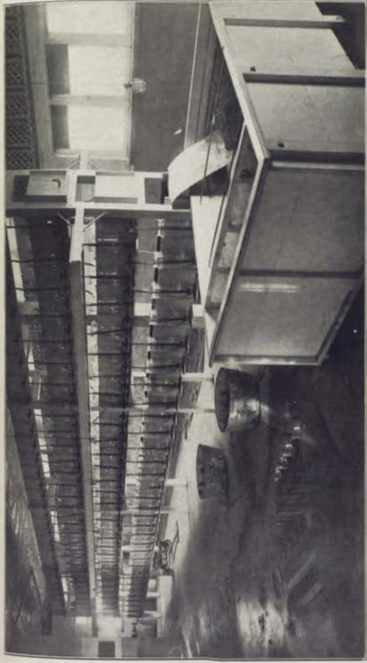
Interior View New Fish Hatchery, East Slope, showing Hatching Equipment.