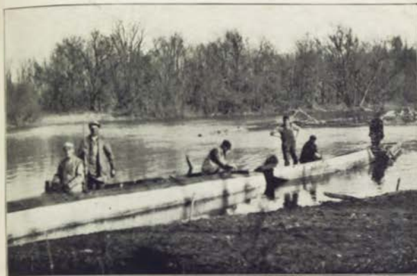
Reeve Work Along Mississippi River. Crew, Launch and Flatboat starting out for day's work.