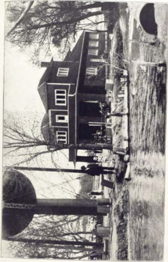
Iowa's New Fish Hatchery at Spirit Lake. Built in 1915, showing steel 26,000 gallon water tank, front view.