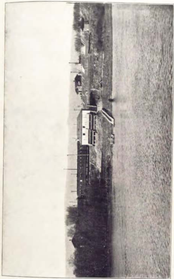
Rescue Station at Sabudia where Millions of Fish are Rescued ready for shipment.