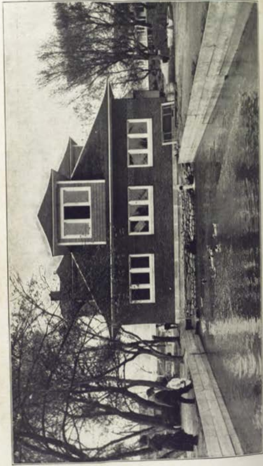
Home's New Fish Hatchery. Home's view, with Mainline in the foreground.