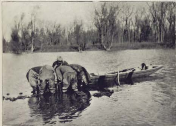
Making the Haul in Shallow Bayou in Reeve work along the Mississippi River.