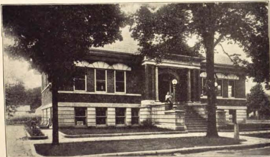
CRESCO PUBLIC LIBRARY—CARNEGIE BUILDING

Library Buildings. Three Carnegie buildings have been dedicated during the past two years, one at Cresco costing $17,500, one at Garner costing $6,500 and one at Traer costing $12,000. A new building has also been erected at Central City from the proceeds