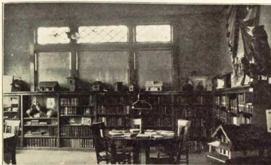
CHILDREN'S ROOM—BIRD WEEK NASHUA PUBLIC LIBRARY

Blanks. Blanks for annual reports required by law to the Commission and the City Council and for other reports from free and association libraries are furnished from the Commission office as well as those for use in keeping daily and monthly statistics, preparing year's budget and making certificate of tax levy to city council in the local libraries. Statistics for publication in the Iowa Official Register were also collected from the libraries and furnished to the Secretary of State. The librarian's register, inaugurated three years ago is continued.