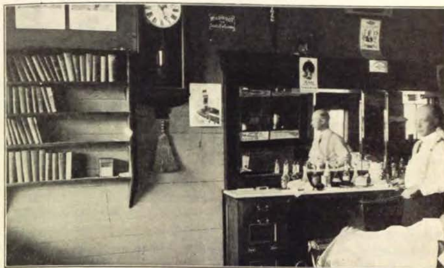
TRAVELING LIBRARY STATION IN A BARBER SHOP

Debate Material. One phase of the work is the debate material loaned to the high schools and smaller colleges of the state. For the subject selected each year by the High School Debating League a list of reference material is prepared and duplicated many times. Material also is supplied on the many other subjects of debate constantly called for.