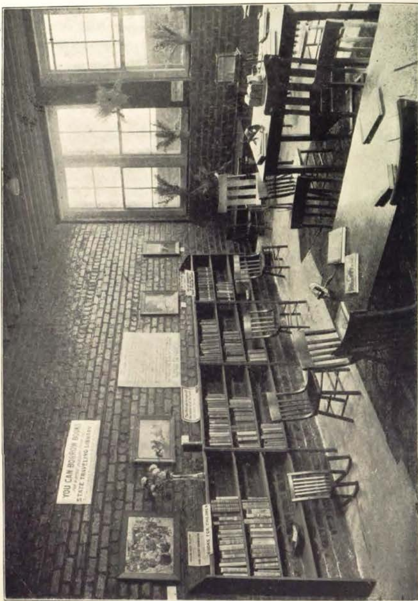
LIBRARY COMMISSION EXHIBIT—STATE FAIR 1915