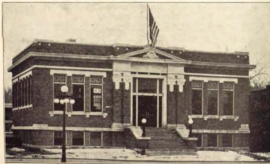
TRAER LIBRARY—CARNEGIE BUILDING

Organization. In addition to assistance given in the establishment of libraries, the work of extension and supervision includes also help given to libraries already in existence. To this end the secretary is assisted by a trained organizer whose services in the installation of modern methods and the instruction of librarians is of great value in increasing the efficiency of the smaller libraries whose income will not allow the employment of a trained librarian. The time spent in each place varies from a few days to three or four weeks, depending upon the needs of the work.