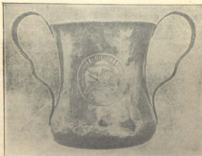
rophy Presented to the National Rifle Association America to the Iowa State Rifle Association.

Open during the meeting up to the close of firing on Thursday, October 10th, to members of the Iowa Rifle Association only.