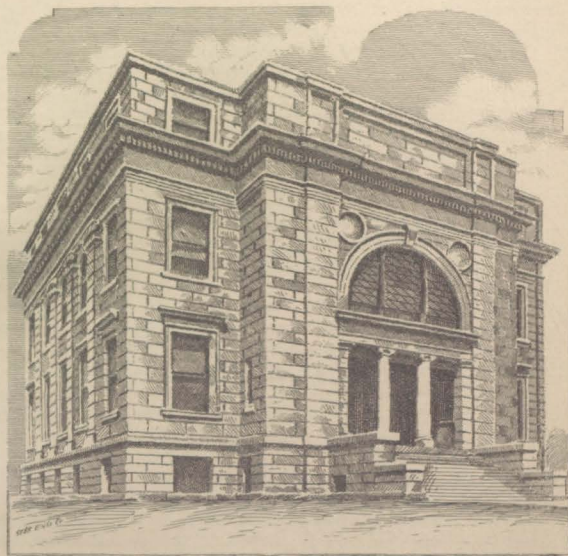
THE STATE HISTORICAL BUILDING.

Up to this time every effort consistent with the limits of the appropriations set apart by the legislature has been put forth to increase the attractions of the museum. The collections now include seven large autograph cases, which will be filled as soon as the accumulations can be placed in the drawers; a collection of recent, aboriginal, and prehistoric pottery—some of the most interesting specimens of which were found in our own state; a large collection of stone implements, among which is an Iowa axe weighing 31\frac{3}{4} pounds—one of the largest ever discovered—with hundreds of flints; two large cases of birds—mostly species found within our state; many Iowa mammals; four large aquariums stocked with a collection of Iowa fishes; a case of Indian