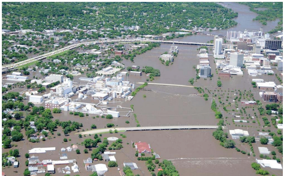
Iowa Civil Air Patrol

Climate models predict that the frequency and intensity of precipitation in Iowa will increase in the coming years, leading to an increasing number of severe flood events and greater stresses on transportation assets.