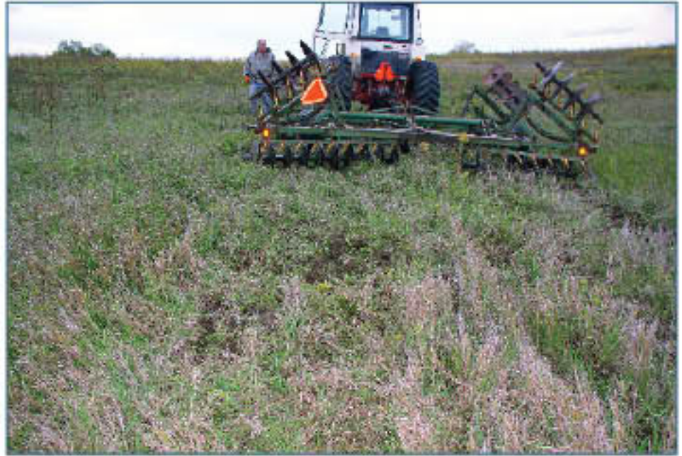
Above: On the second pass, you may begin to see some reduction in the predominant vegetation.

To bring back the birds, you will need to turn back the clock, recreating the more open, weedy conditions that favor grassland species.