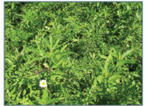
Above: Ragweed Below: Goldenrod

Some species that would be good to interseed include: Partridge pea, Red clover and Alfalfa. We do not recommend using Birdsfoot trefoil or the shorter growing clovers. Plant the legumes at less than one-half the normal rate or you will be replacing the thick grass cover with legume cover that is also too thick.