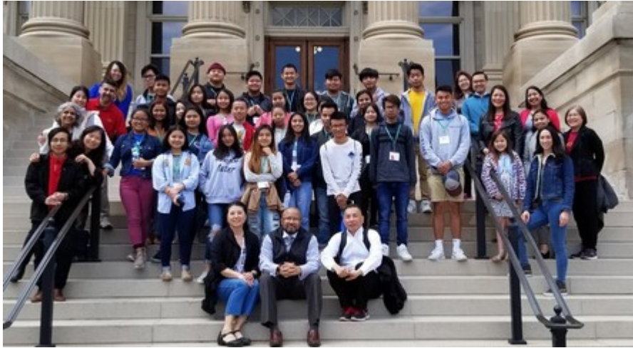
Iowa State University Tour - Hosts: ISU Office of Diversity and Inclusion & Asian Faculty and Staff Association