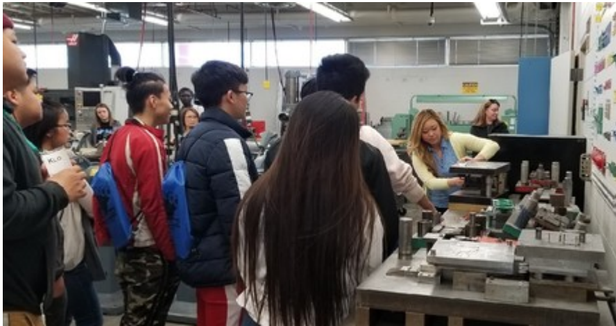
DMACC-Ankeny - Plastic Injection lab demonstration