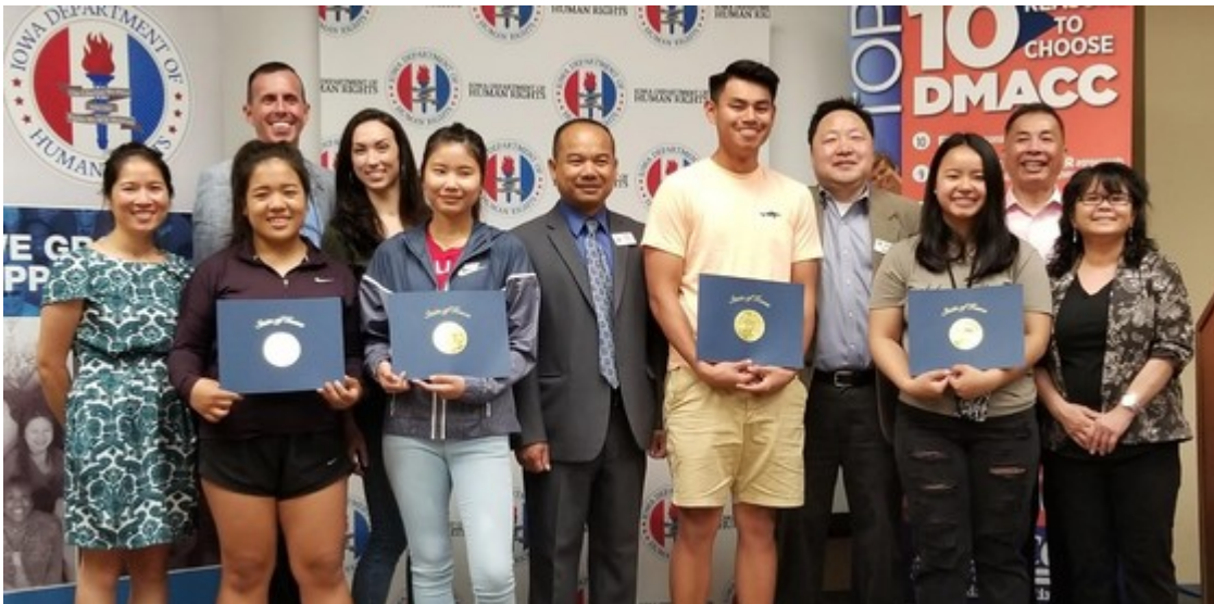
2019 EducAsian Scholarship Winners - Scholarships possible from community donations to CAPI & DMACC