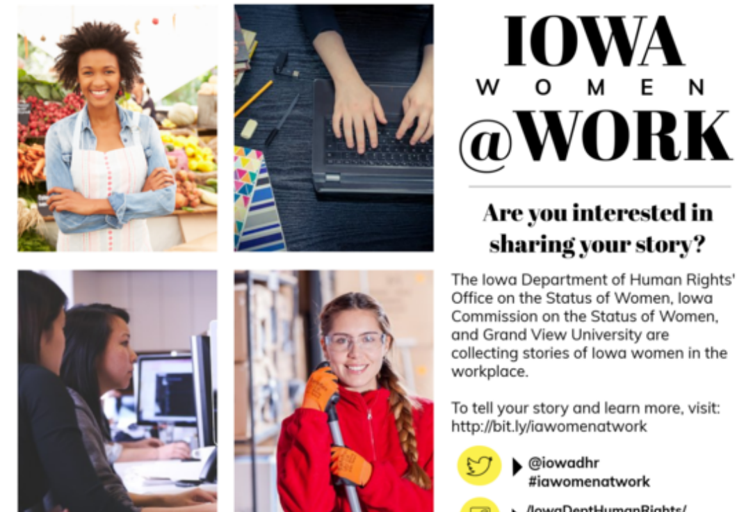
For more information, visit: http://bit.ly/iawomenatwork