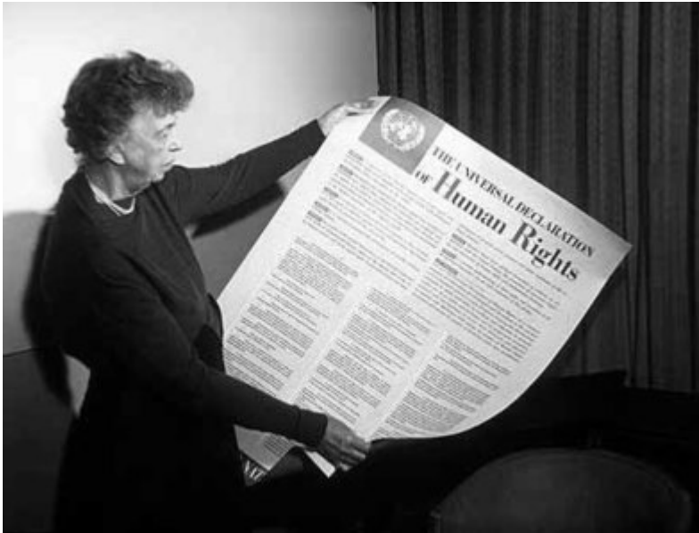
Pictured above: Eleanor Roosevelt, holding the Universal Declaration of Human Rights.