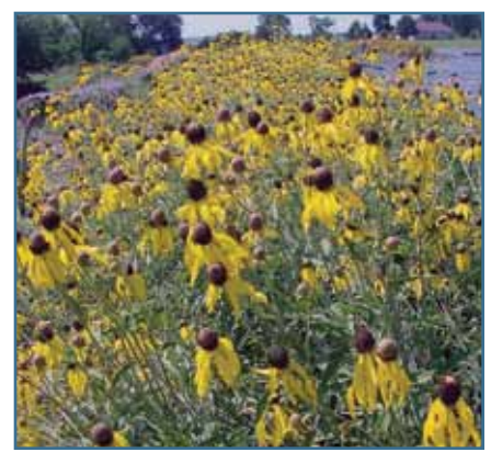
Above: Don't panic or disk up the field if you can't see the seedlings during the first year. That's normal. By the second or third year, you'll start to see forbs emerge and produce seed, like these grey-headed coneflowers.