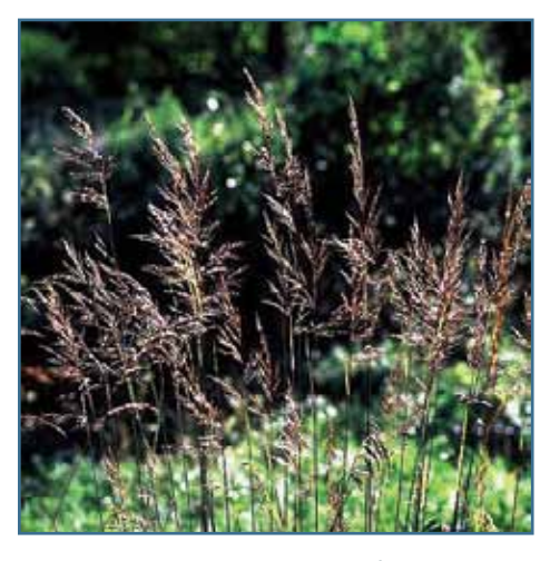
Above: There are hundreds of plants to choose from. The more variety in your planting, the more stable it will become over time. From the top: Rattlesnake master, Purple prairie clover, Sideoats grama, Indiangrass.