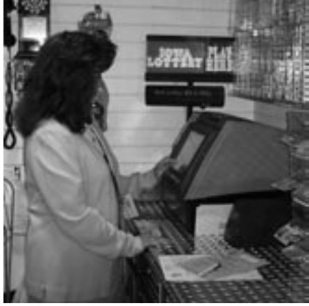
An Iowa Lottery retailer makes a play on the Extrema lottery terminal.

When a player hands you a coupon, don't panic! Just follow the easy steps below to process the coupon and get the proper credit.