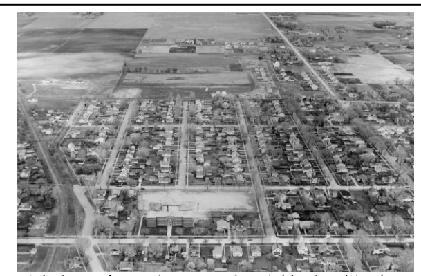
Aerial photo of Ames's Roosevelt neighborhood in the mid-1940s, featuring Fair View Farm located in the upper left corner.

suburbia no longer dramatized heroic builders' flourish, but instead, how a countryside had been razed."<sup>51</sup> But in Parkview Heights the streets were paved, its houses connected to city services, and because it was built after Lyndon Johnson's Conference of Natural Beauty in 1965, ample green space for play and recreation was set aside for neighborhood children.<sup>52</sup>