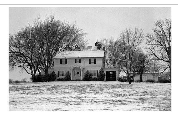
Photo of Edward and Neva's home on Fair View Farm at Christmas in 1948.

consumers with increasing expectations of what a higher income could provide. Additionally, this was the period when industry began decentralizing from major urban centers.<sup>24</sup> This combination put pressure on municipalities to adapt to these changing needs or face diminishing tax revenues as industry and housing left their city limits. To remain competitive, state and local governments needed to attract high paying employers and provide desirable housing alternatives to this growing urban middle class.