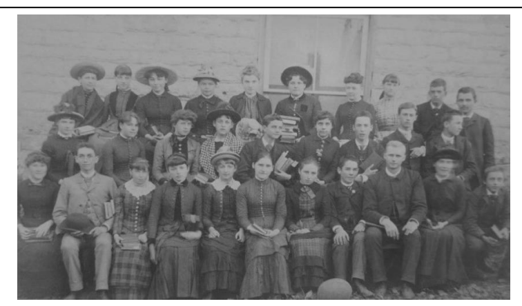
Iowa City High School class picture, 1886.

had left home in 1880 were working or running their own households. Over 60 percent of adolescent females lived at home and had no occupation, and of those, just over half attended school. Around 40 percent of males lived with their parents and did not work, but 73 percent of those boys were enrolled in school. These numbers suggest that despite high teen employment rates the East Coast trend towards an extended adolescence—with longer periods of school attendance and family residence—had started to affect Dubuque.