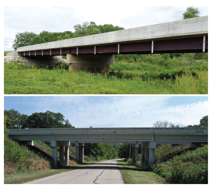
I-280 in Illinois (top) and US 151 in Wisconsin (bottom) SHM system demonstration bridges