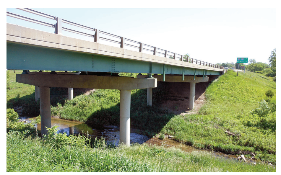
I-80 SHM system demonstration bridge in Iowa

Bridge maintenance strategies depend on information used to estimate future condition and remaining service lives of bridges. The purpose of future bridge-condition assessment is to determine when to undertake repairs or maintenance to keep bridge condition within acceptable limits. The estimation of residual or remaining life is an important input for budgeting and setting longer-term repair and maintenance priorities.