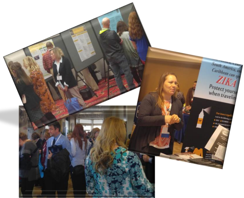
Scenes from the 2018 Iowa Governor's Conference on Public Health