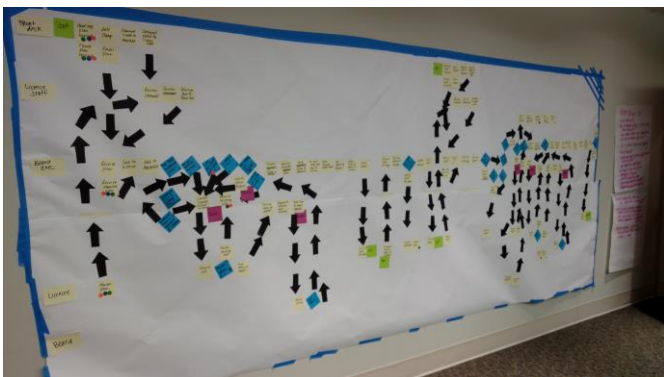
Process flowchart created during the Professional Licensure bureau's quality improvement project.

This week, IDPH posted an RFP for a second medical cannabidiol manufacturer. Interested parties must notify their intent to apply by 4:00 p.m. on May 16, 2018. Formal applications are due May 31, 2018, and the department will announce its intended licensee June 29, 2018.