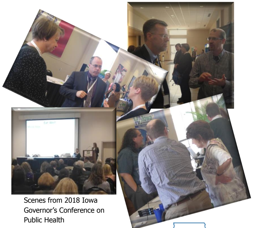
Scenes from 2018 Iowa Governor's Conference on Public Health

Get more IDPH news and information by subscription through Granicus. You may subscribe to many topics of interest. For IDPH topics, scroll down to "Public Health, Iowa Department of."