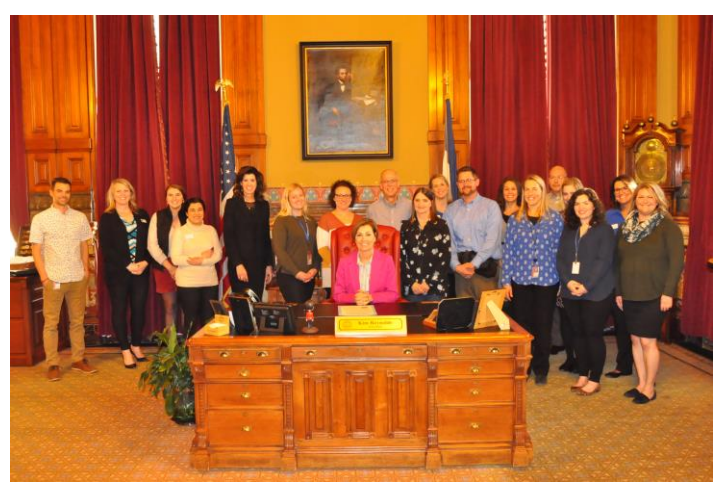
Governor Reynolds signed proclamations designating March as Colorectal Cancer (pictured above) and Problem Gambling Awareness Month.

According to the most recent BRFSS data, the percentage of Iowans reporting they have high blood cholesterol as indicated by a health care professional dropped from 36.3% in 2017 to 34.1% in 2018.