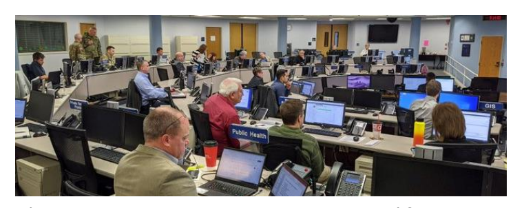
The State Emergency Operations Center is activated for COVID-19 response.

I was pleased to represent IDPH at a White House meeting with state, county and city health officials from more than 30 states and territories to continue discussions on the federal, state and local partnership response to COVID-19. IDPH continues to work with the governor's office, legislators, other state agencies, healthcare providers, the media, long-term care facilities, local preparedness coalitions and public health agencies, schools, businesses, law enforcement, EMS providers, universities and community colleges, and others to create and administer plans and procedures as they are needed. Visit the IDPH COVID-19 webpage for updated information and data.