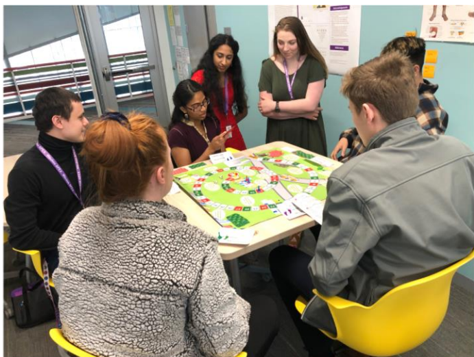
Waukee APEX students play the Life Course game.

IDPH staff have been visiting with Waukee High School APEX (Aspiring Professional Experience) students to discuss how public health affects their lives. High school seniors in the "Exploration of Health Sciences and Medicine" track took part in the "Life Course Game," which explores the risk and protective factors that affect a person's overall life course and health. The students also heard directly from IDPH staff about how their work helps to protect and improve the health of all Iowans.