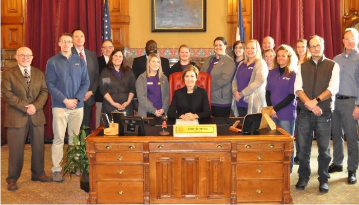
Advocates join IDPH staff and Governor Kim Reynolds in recognizing Brain Injury Awareness Month.

Governor Reynolds continues to support public health efforts with state proclamations. The governor recently recognized Cervical Cancer Awareness Month, Radon Action Month and Brain Injury Awareness Month. Upcoming signings will include proclamations for Problem Gambling and Colorectal Cancer Awareness.