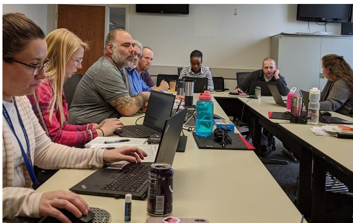
IDPH staff in the IMS gather for a morning briefing.

IDPH continues to work with federal, state and local partners to monitor and inform Iowans about the 2019 Novel Coronavirus (COVID-19) . A modified IMS structure has been implemented at the department level to aid our state-level response. At this time, the general public risk of COVID-19 is low; influenza is a greater concern and IDPH continues to urge Iowans to receive the flu vaccine and remember the Three Cs .