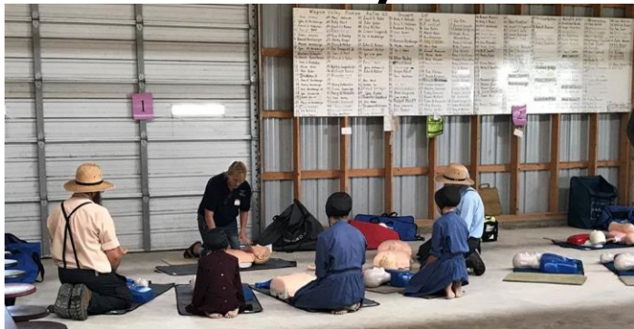
Photo taken with permission. Due to religious and cultural considerations, no faces are shown.

In August, nearly 40 individuals attended the fourth Annual Health and Safety Day for the Amish Community, hosted by Buchanan County Public Health and Fairbank EMS & Fire. The event included opportunities to learn hands-only CPR, Stop The Bleed and first aid, as well as car seat safety, pedestrian safety, poison prevention, immunization information and well water testing information.