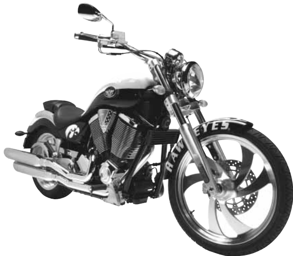
The custom-painted Victory Vegas motorcycle is manufactured by Victory in Spirit Lake, a division of Polaris Industries.

Manufactured by Victory motorcycles in Spirit Lake, Iowa, a division of Polaris Industries, this one-of-a-kind motorcycle was painted by Custom Paint Specialists in Des Moines and furnished by Van Wall Motorsports of Perry. 🏍️