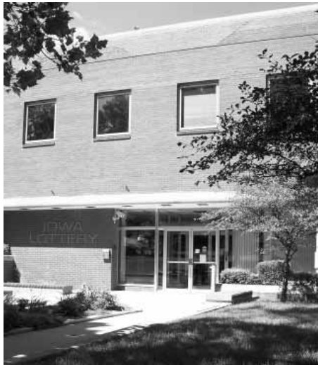
The new Iowa Lottery headquarters building is located at 2323 Grand Ave. in Des Moines.