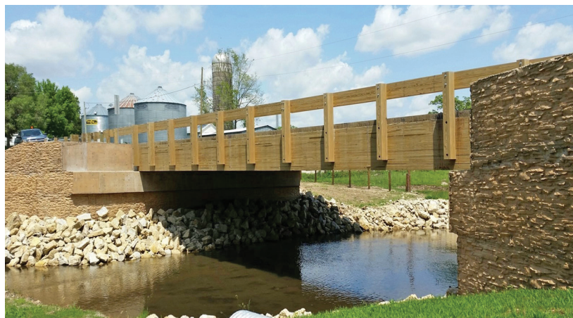
Completed Buchanan County Bridge