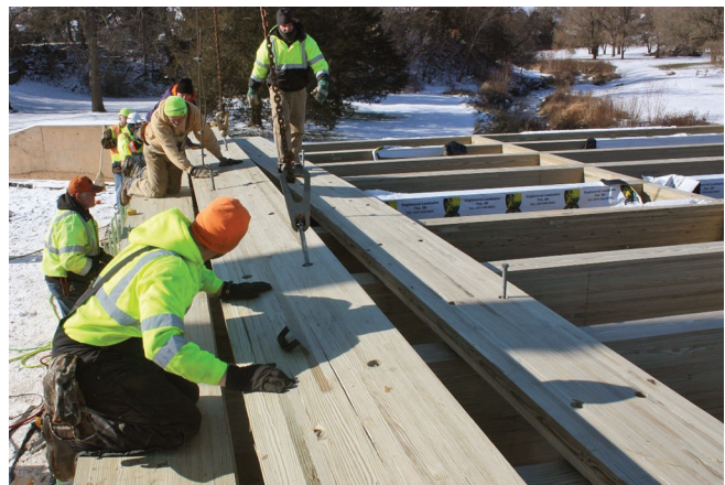
Placing deck panel on the Buchanan County Bridge