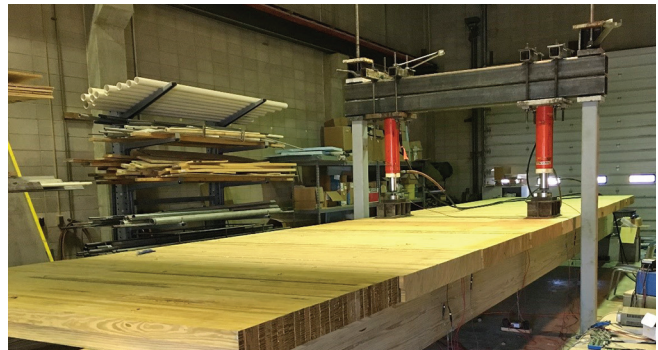
Glulam deck sections epoxied to large-scale laboratory specimen