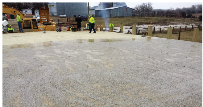
Thin epoxy overlay being applied to deck of Buchanan County Bridge